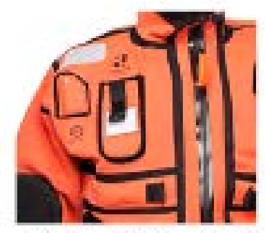
Easy donned zipper in PU