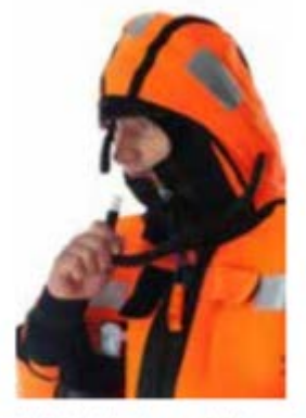
Inflatable lung in hood for improved water tightess and freeboard