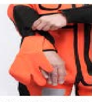
Three-linger gloves in sleeve attached with elastic band